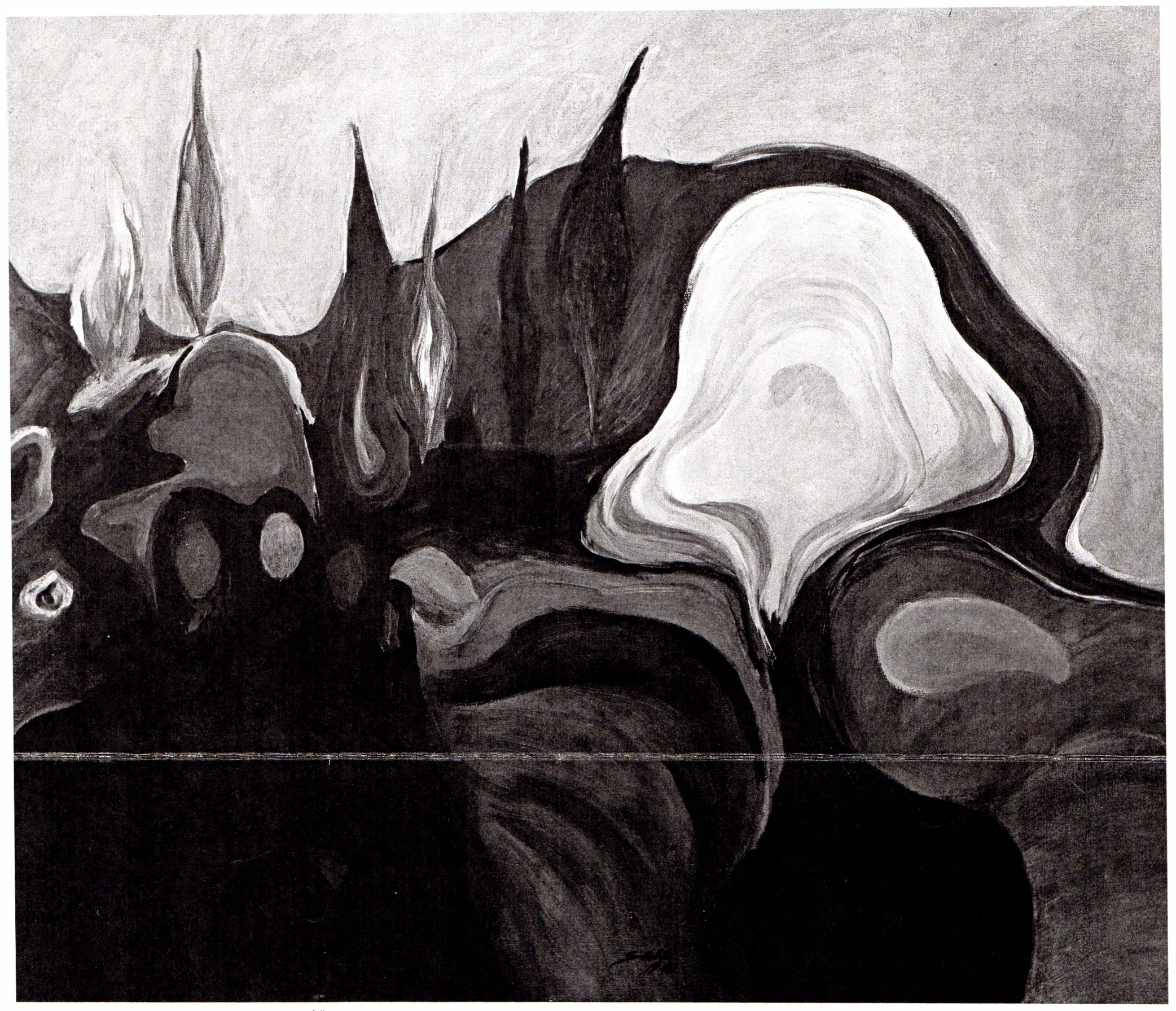
Tuscany » - 1978 - Oil on Canvas (31\frac{1}{2}" \times 39\frac{1}{2}". Cms. 80 \times 100)