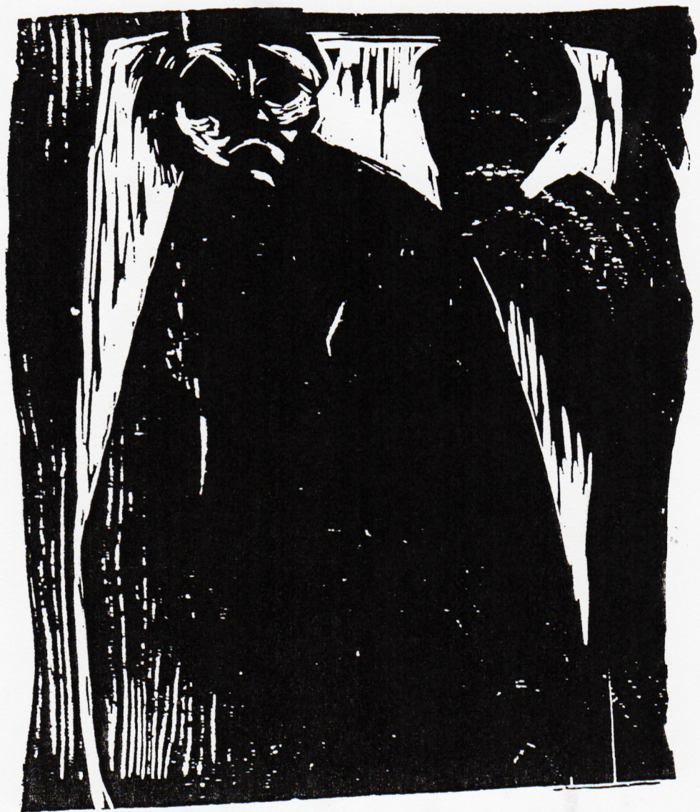
"THE WORLD HAS CREATED ME...." Woodcut - 1963