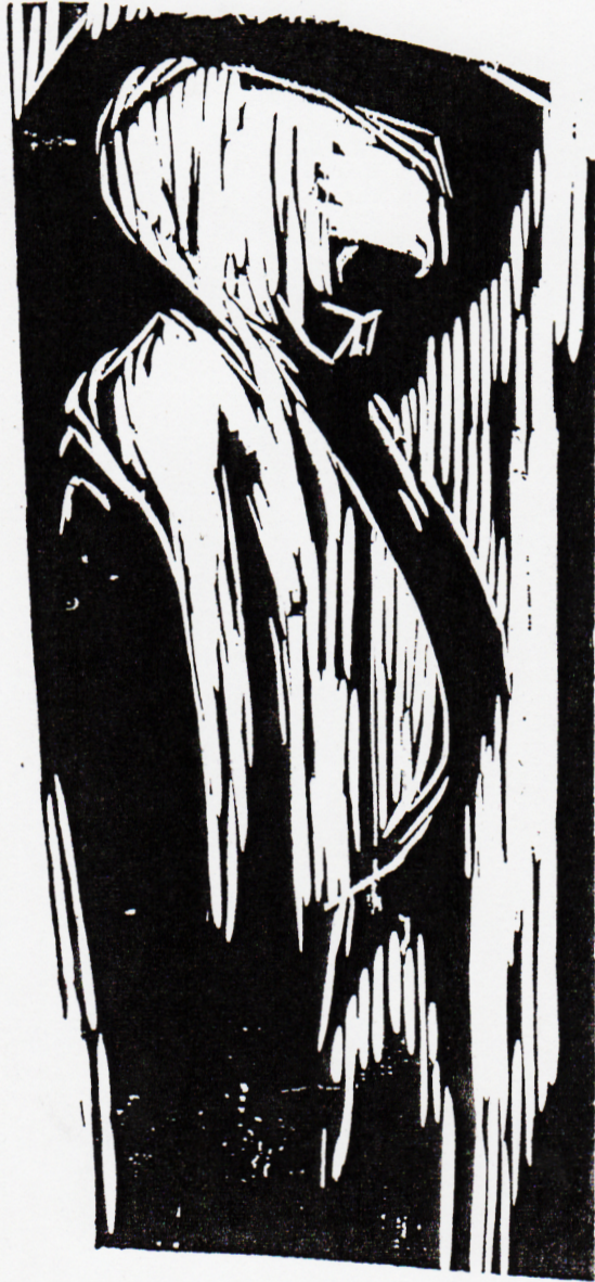
Woodcut - 1965